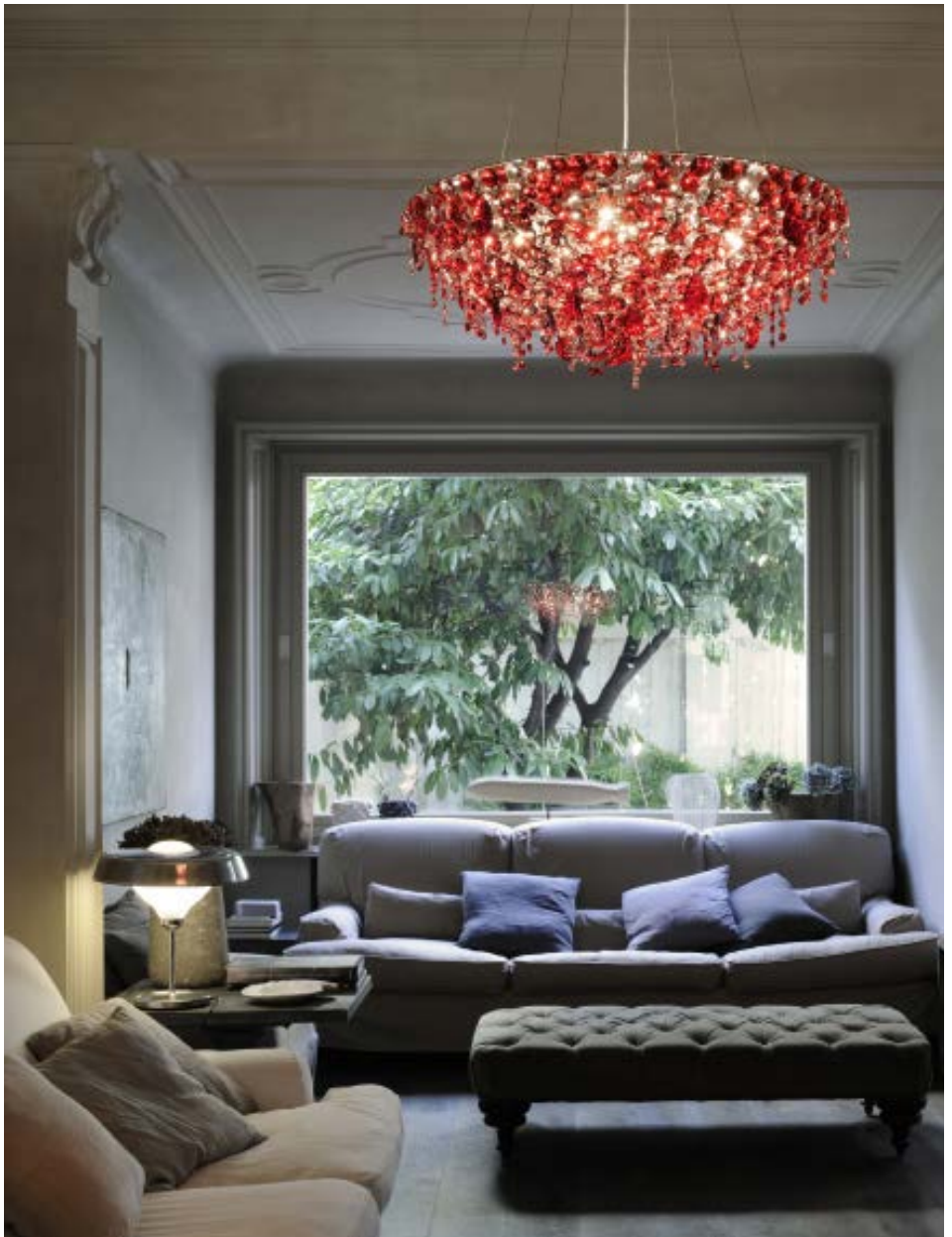
in the picture Ugolino circular 80

Via Fratelli Vivarini 7, I-20141 Milano, Italy tel +39 02 895 023 42 fax +39 02 895 409 74 info@lollimemmoli.it www.lollimemmoli.it